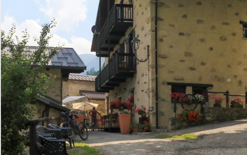
Attribution : Il Rifugio escursionistico l'Arbergh (Giorgio Bernardi)