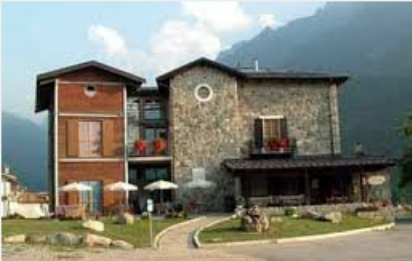
Attribution : La Locanda del Sorriso (Archivio APAM)