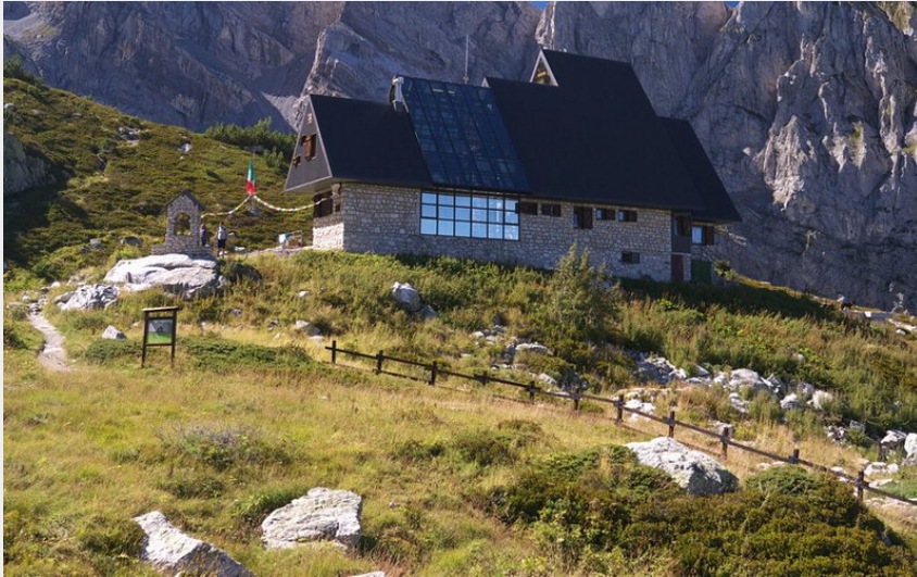
Attribution : Il Rifugio P. Garelli