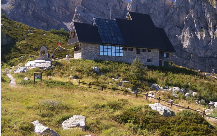
Il Rifugio P. Garelli