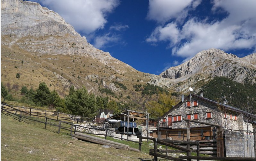
Attribution : Il rifugio Mongioie (Archivio APAM)