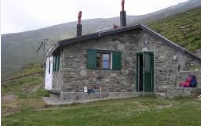
Il Rifugio Valcaira