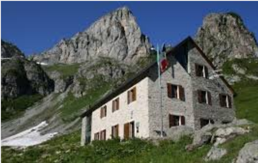
Attribution : Il Rif. Mondovì (Archivio APAM)