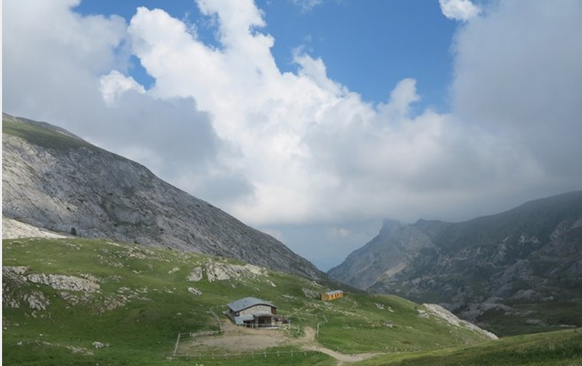
La conca e il Rif. Don Barbera