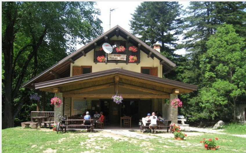
Attribution : Rifugio Pian delle Gorre (Archivio APAM)