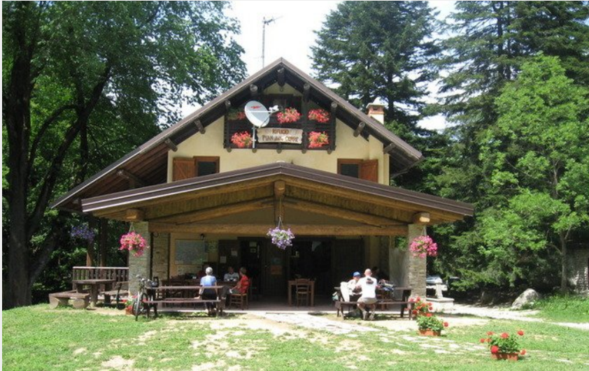
Rifugio Pian delle Gorre