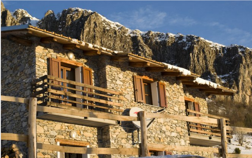
Attribution : Il rifugio al tramonto