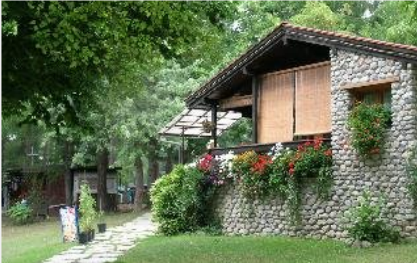
Attribution : L'ingresso del campeggio (Archivio APAM)