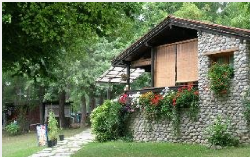
Attribution : L'ingresso del campeggio (Archivio APAM)