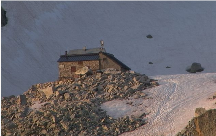
Attribution : Refuge Questa (Augusto Rivelli)