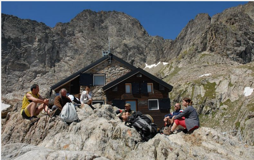
Attribution : Refuge Pagari (Augusto Rivelli)