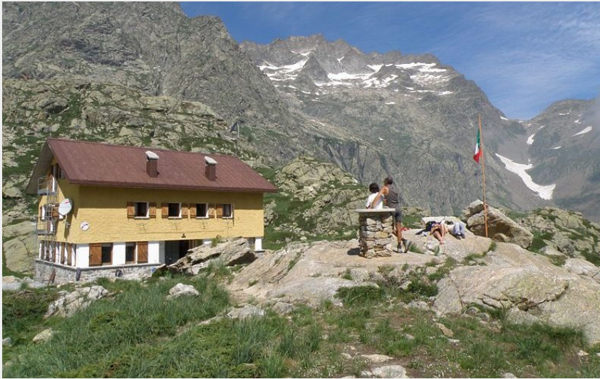
Le refuge Genova