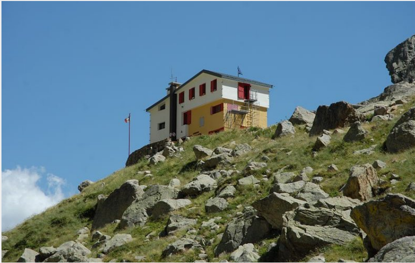
Attribution : Le refuge Soria (Augusto Rivelli)