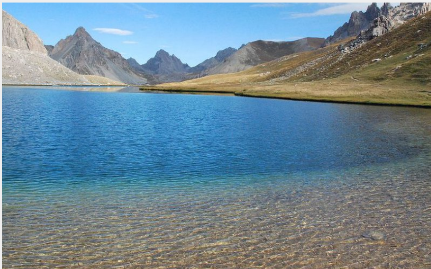
Le lac de l'Oronaye, 2411 m), et le Bec du Lièvre, (2770 m), en fin d'été.