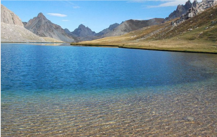
Le lac de l'Oronaye, 2411 m), et le Bec du Lièvre, (2770 m), en fin d'été.