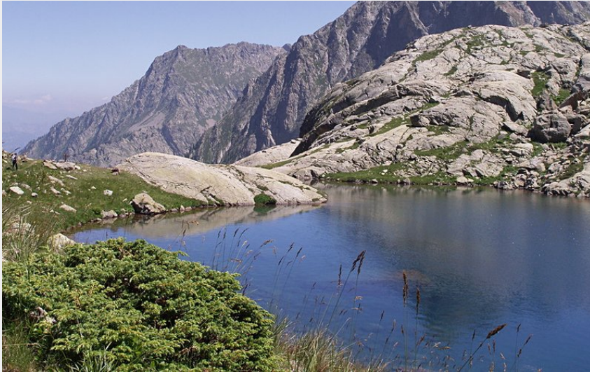
Il lago soprano della Sella (Roberto Pockaj)