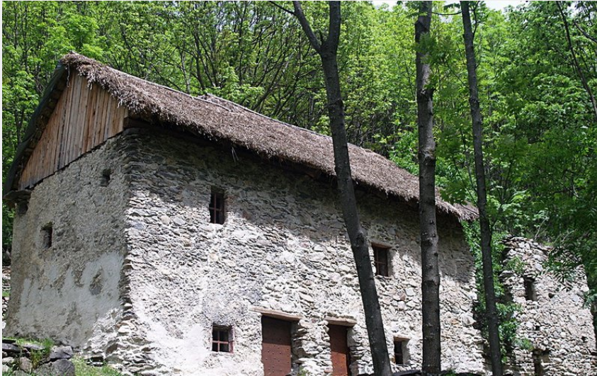
La casa a Tetti Bartola con tetto in paglia di segale (Roberto Pockaj)