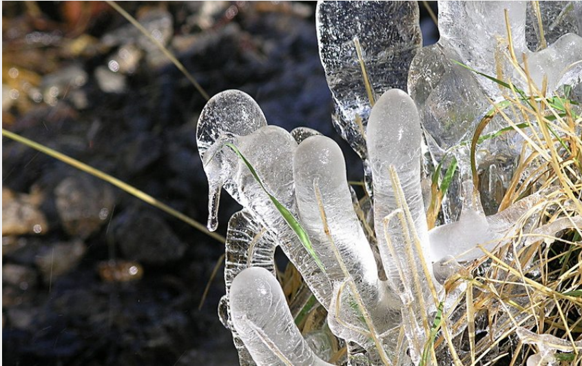
Fili d'erba ghiacciati nei pressi del Rifugio Regina Elena