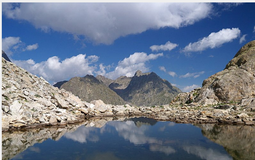
Uno dei due laghetti nei pressi del Colle di Fenestrelle (Roberto Pockaj)