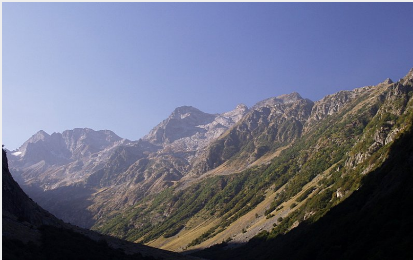
L'ingresso a Pra del Rasur