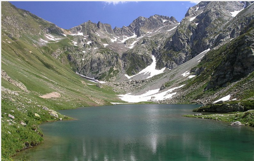
Il Lago del Vei del Bouc