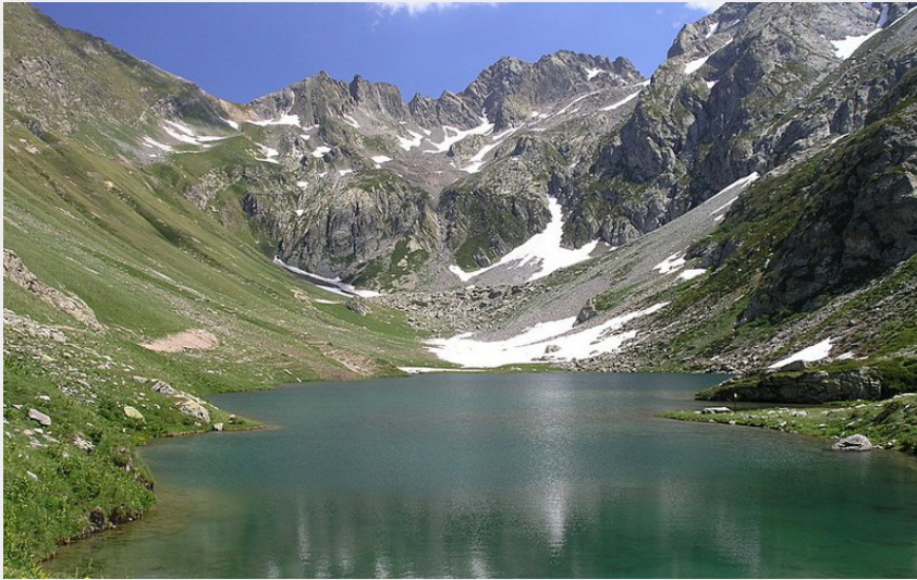
Il Lago del Vei del Bouc