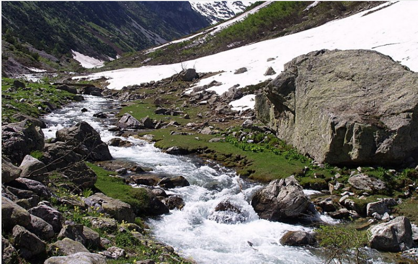
Il Vallone del Sabbione a monte di Gias Valera (Roberto Pockaj)