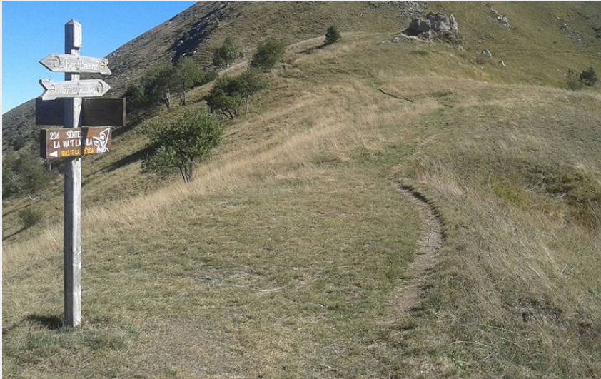
La dorsale prativa che sale al Monte Vecchio dal Colle Arpiola (Roberto Pockaj)