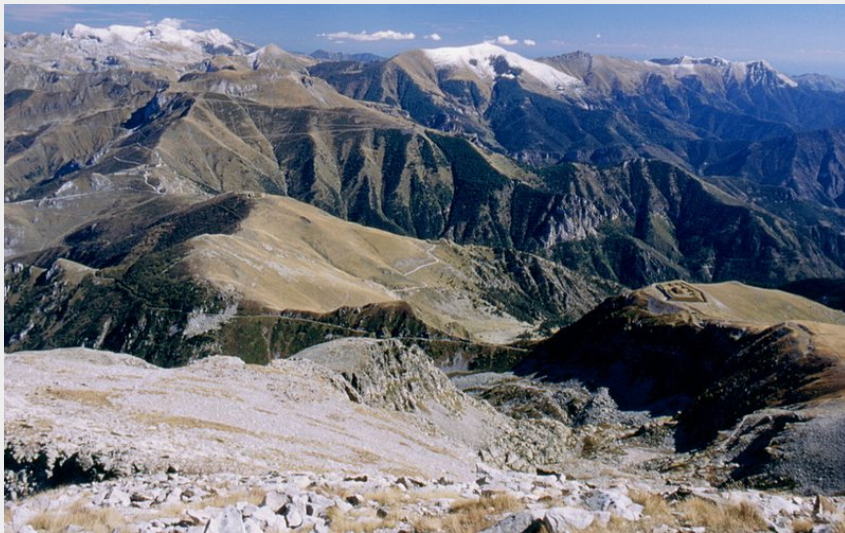
Panorama verso est dalla Rocca dell'Abisso (Roberto Pockaj)