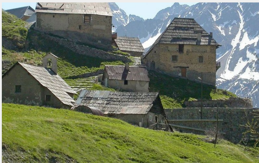
Le hameau de Bousieyas au printemps. Névés en arrière plan. (Anthony Turpaud - PNM)