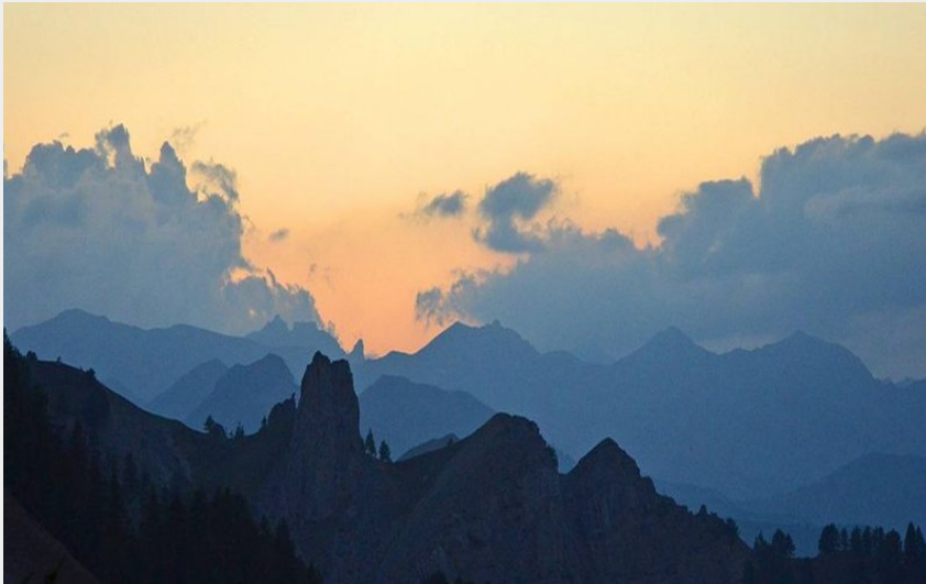
Aiguilles d'Isola, coucher de soleil en Tinée