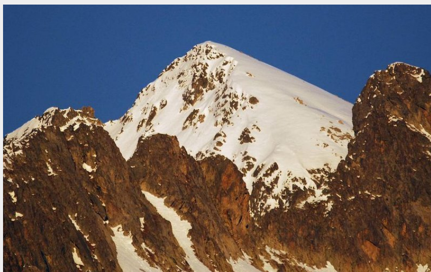
Le mont Colomb, enneigé au mois de novembre, (2816 m)