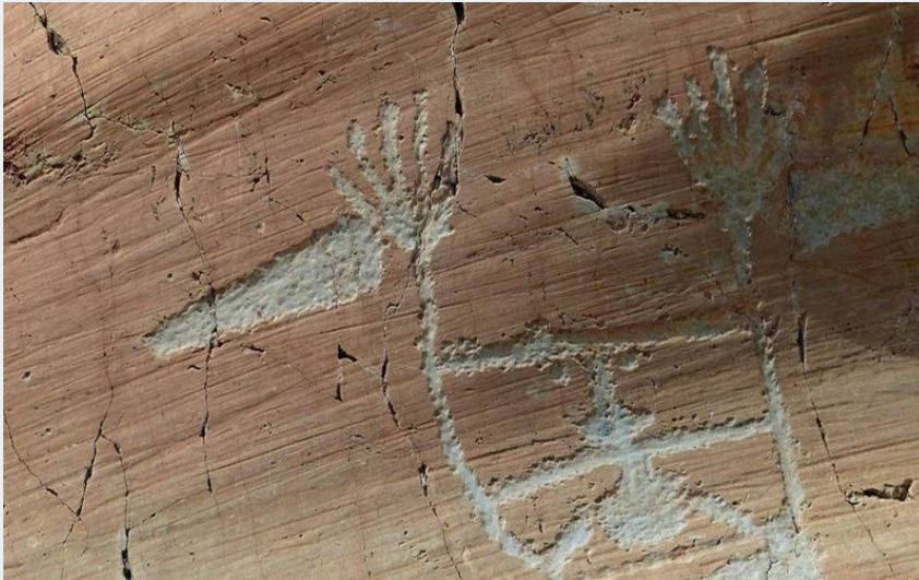
Gravure rupestre de la vallée des Merveilles, le Sorcier