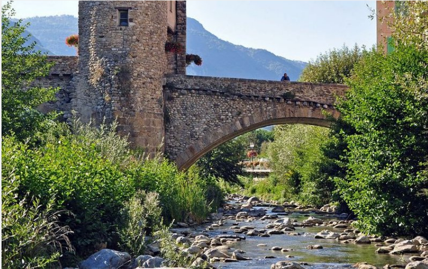
Le vieux pont médiéval du village Sospel.