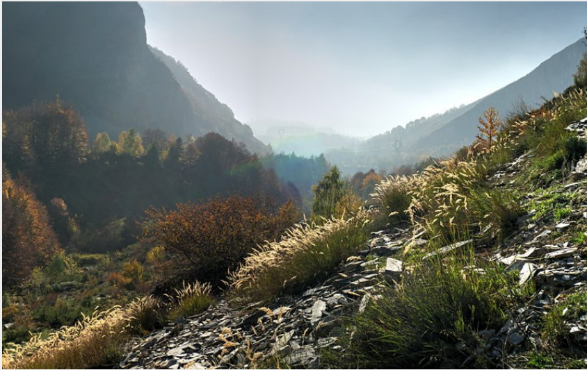
Controluce sul sentiero per Tetti Stramondin (Roberto Pockaj)