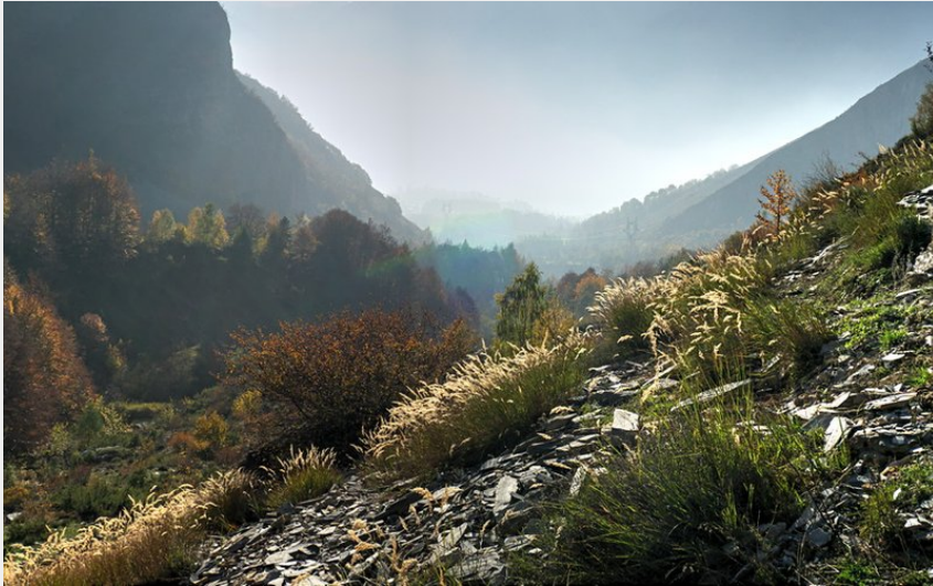
Controluce sul sentiero per Tetti Stramondin (Roberto Pockaj)