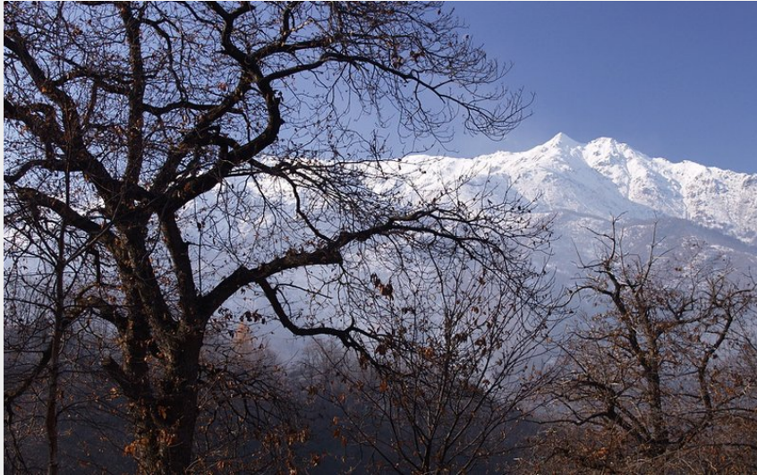
I castagneti che si incontrano arrivando a Tetti Fuggin