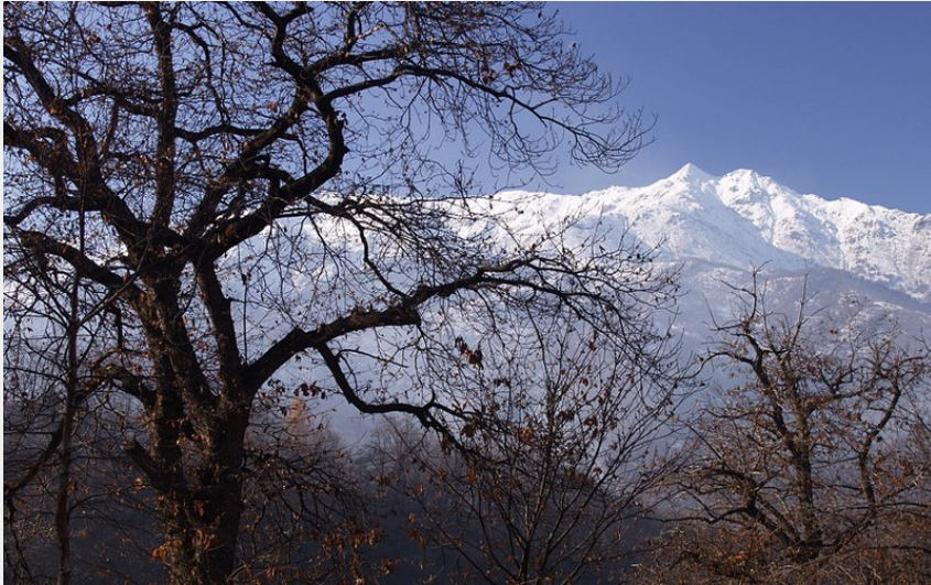
I castagneti che si incontrano arrivando a Tetti Fuggin