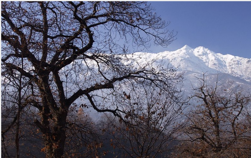
I castagneti che si incontrano arrivando a Tetti Fuggin