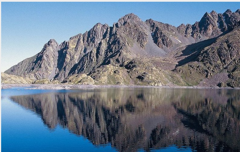
Le lac du Rabuons, perché à 2500 m d'altitude et entouré de hauts sommets comme le Ténibre, (3031 m), le Grand Cimon, 2995 m)