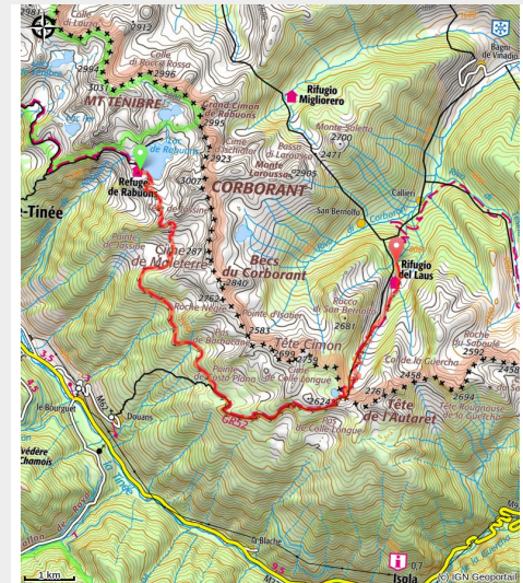
Le lac du Rabuons, perché à 2500 m d'altitude et entouré de hauts sommets comme le Ténibre, (3031 m), le Grand Cimon, 2995 m)

A cross-border itinerary which connects France and Italy. The many bunkers on the Colle Longue site are relics from the zone's military past.