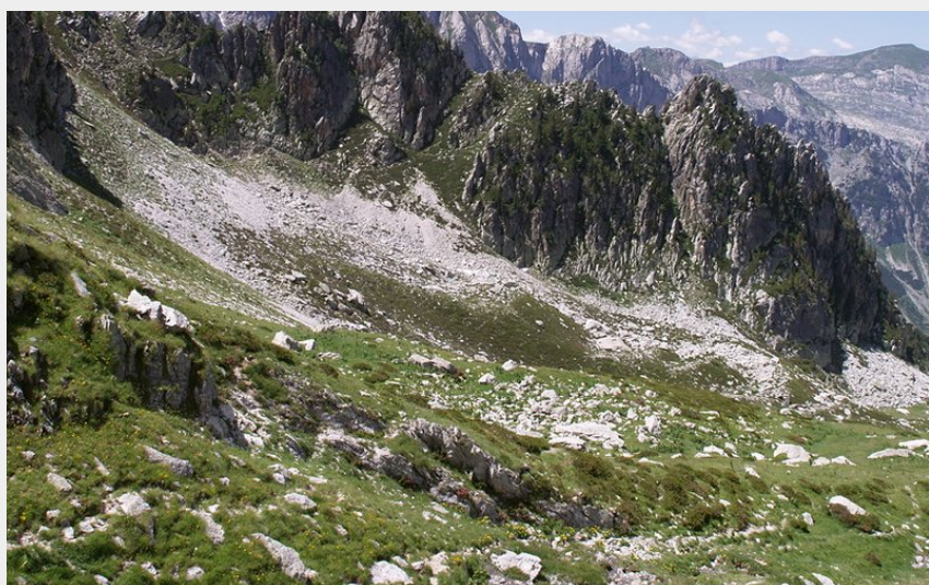
Il vallone che conduce a Porta Sestrera dal Rifugio Garelli (Roberto Pockaj)