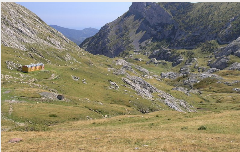
Il vecchio Rifugio Don Barbera e il Vallone dei Maestri dal Colle dei Signori