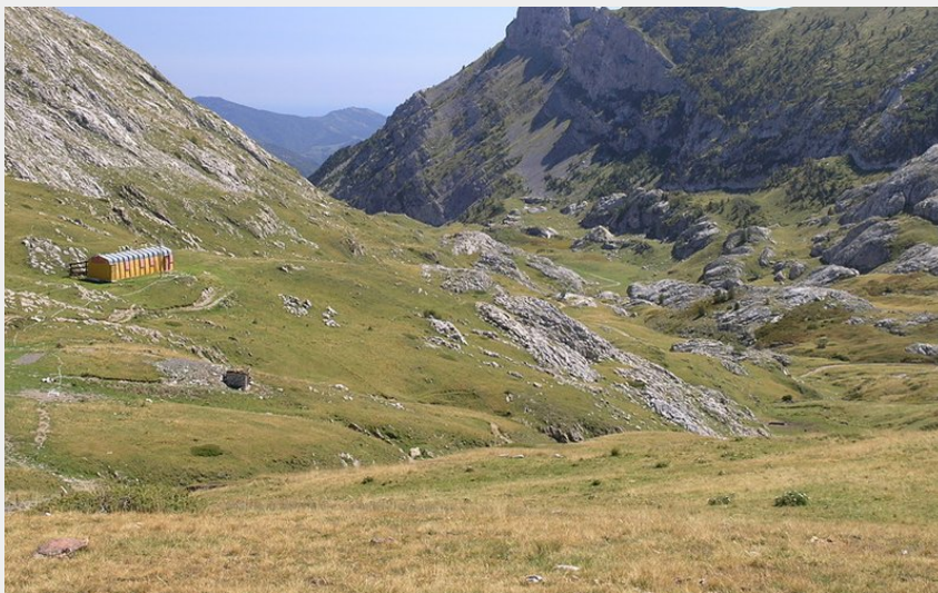
Il vecchio Rifugio Don Barbera e il Vallone dei Maestri dal Colle dei Signori