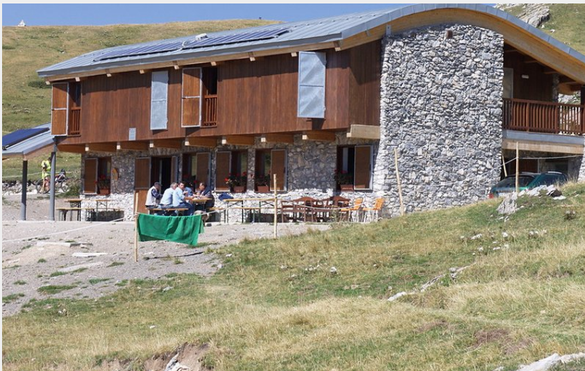
Il nuovo Rifugio Don Barbera