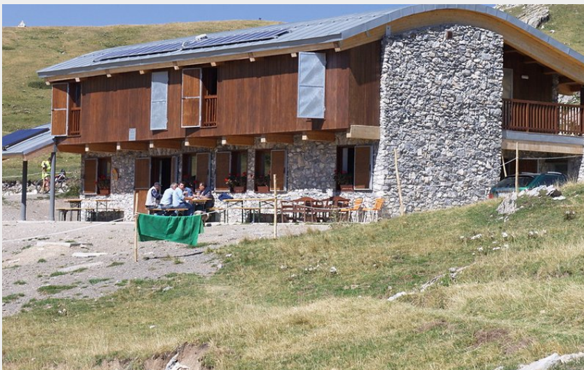
Il nuovo Rifugio Don Barbera