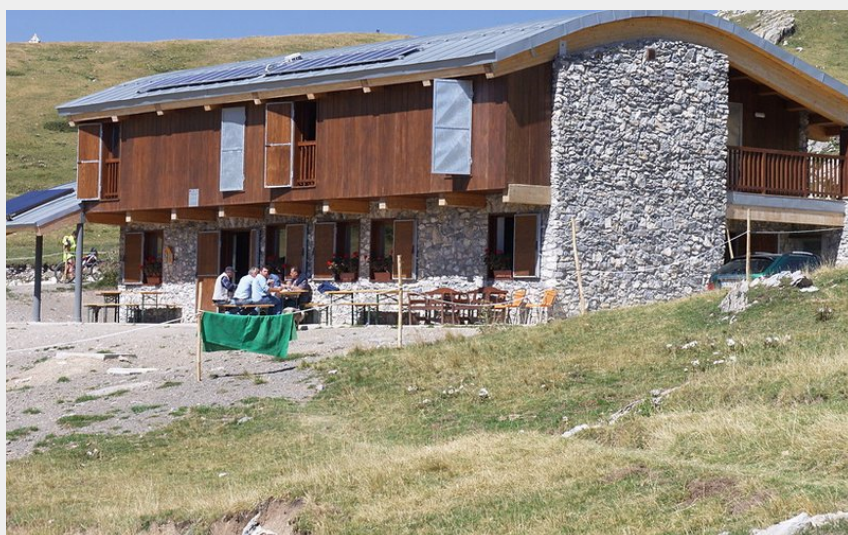
Il nuovo Rifugio Don Barbera