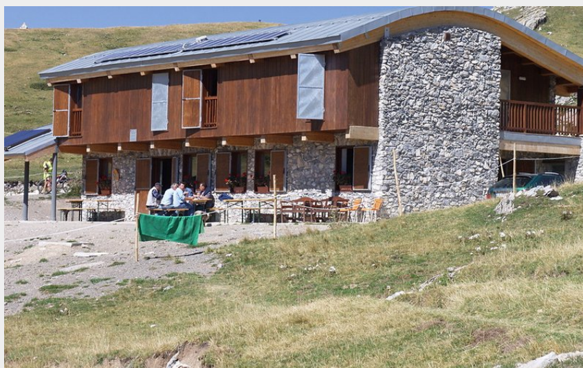
Il nuovo Rifugio Don Barbera