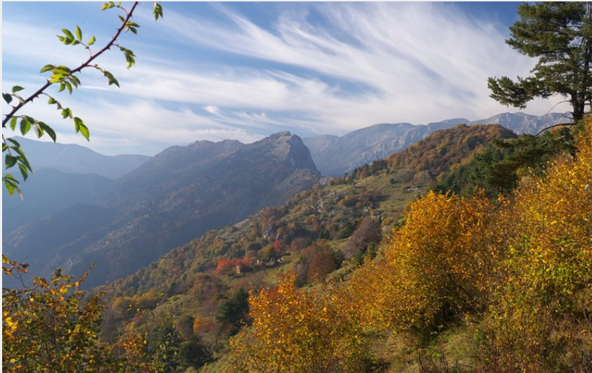
Panorama dai pressi della Madonna dei Cancelli