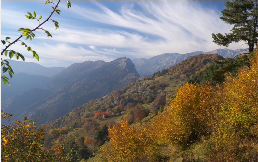
Panorama dai pressi della Madonna dei Cancelli