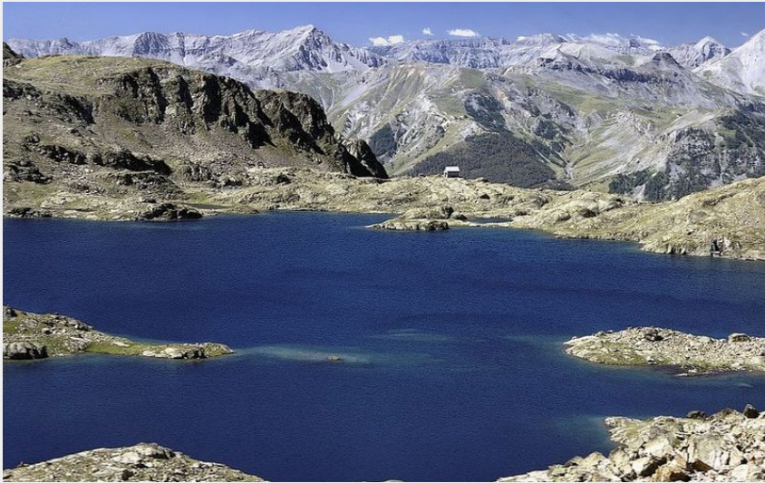
Randonnée Tinée. Lac de Rabuons, 2523 m.