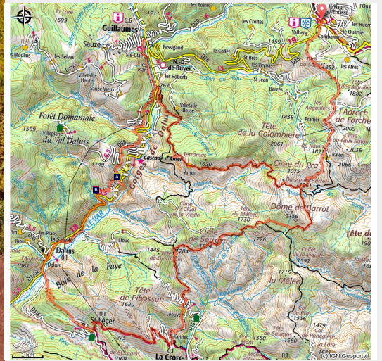
Randonnée gorges de Daluis. Couleur d'automne pour les arbres feuillus et le rouge des gorges de Daluis.

An itinerary which is mainly located in the Daluis Gorges Regional Nature Reserve.