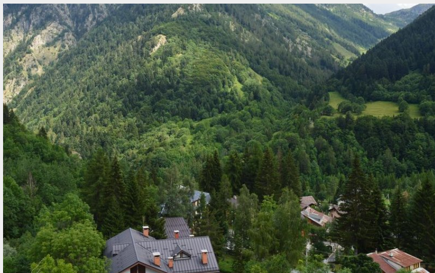
Bagni di Vinadio (Fabrice Henon)