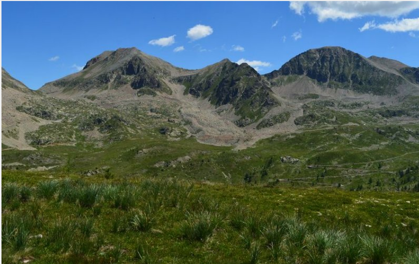
Colle Dei Morti et Passo Orgials