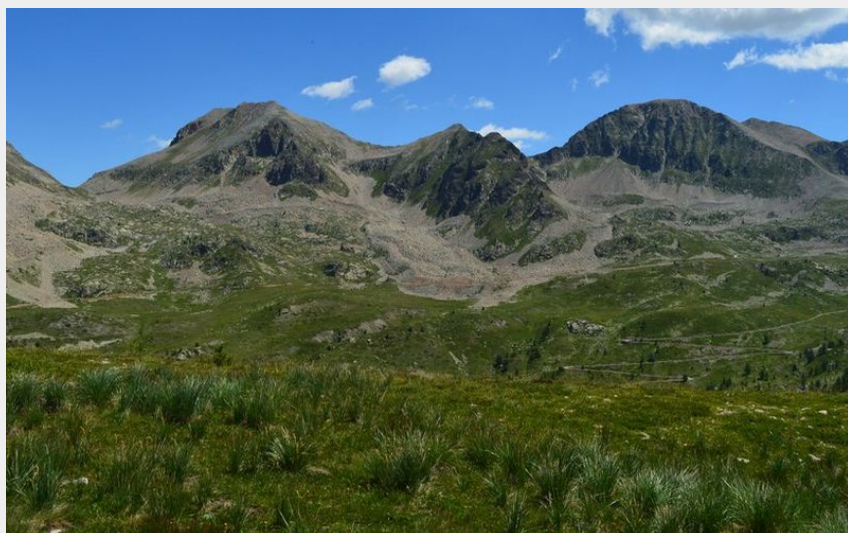
Colle Dei Morti et Passo Orgials