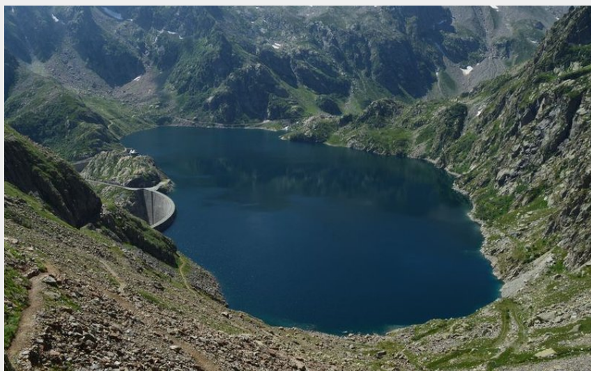
Bacino del Chiotas du Col Chiapous (Fabrice Henon)