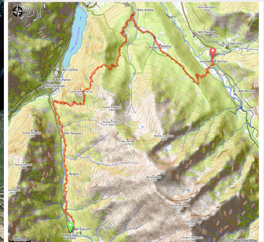
Le "Vallone de la Barra" dans le Parco Naturale delle Alpi Marittime, le versant italien du Gélas, (3143 m).

In a bright beech wood, it is once again a forest environment for this medium-sized mountain stage, which connects the localities of San Giacomo and Trinità, two hamlets of the commune of Entracque.