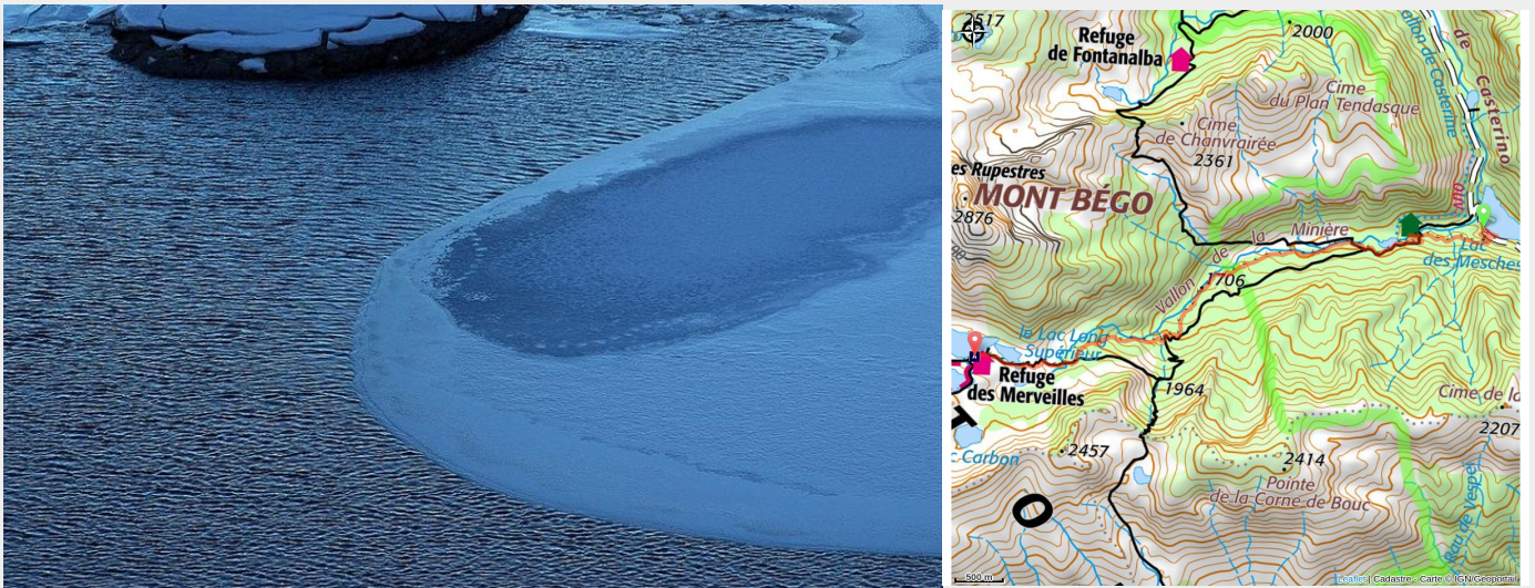
Randonnée Vallée des Merveilles. Le lac des Mesches, (1381 m), partiellement gelé et recouvert de neige en hiver