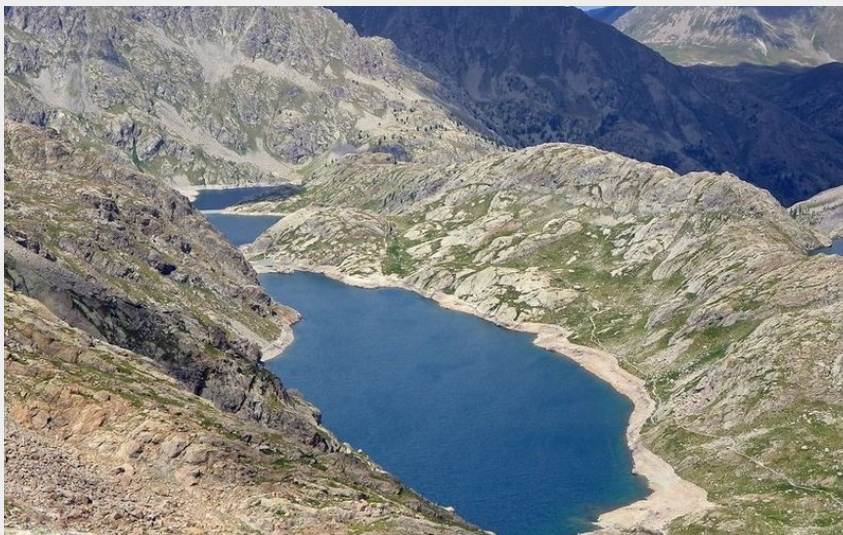
Randonnée Vallée des Merveilles : le lac Basto, le lac Noir, et le lac Vert