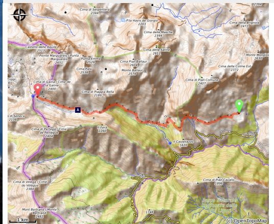
Randonnée Marguareis. Le Marguareis, (2651 m), depuis Déa au mois de novembre.

This stage is mostly at low altitude and on easy paths, however, pay attention to the waymarking after Gola della Chiusetta.