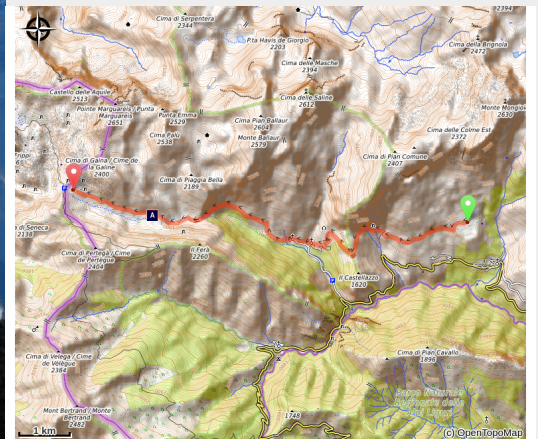
Randonnée Marguareis. Le Marguareis, (2651 m), depuis Déa au mois de novembre.

This stage is mostly at low altitude and on easy paths, however, pay attention to the waymarking after Gola della Chiusetta.